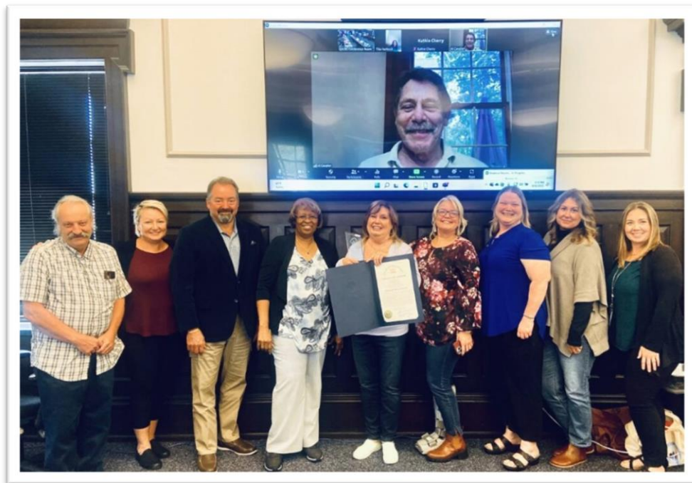
GACEC members and staff at the 2022 Annual Planning Retreat.