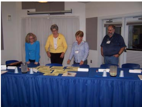
Adult Transition Services Committee Members participate in a Collaborative Activity at the GACEC Retreat

The four standing issues committees do most of the actual work of the Council. The Infant and Early Childhood Committee is concerned with issues surrounding the identification and initial services for children birth through age five. The Children and Youth Committee looks into specific issues related to the school age children of our community. The Adult Transition Services Committee monitors and works on issues such as housing and vocational opportunities for individuals who are moving into adulthood; and the Policy and Law Committee reviews proposed regulations and legislation in order to comment on how persons with exceptionalities in our state will be affected. The two administrative committees handle personnel issues and membership monitoring and recruitment for the Council. Ad-hoc committees are created as needed. This framework has served the GACEC well.