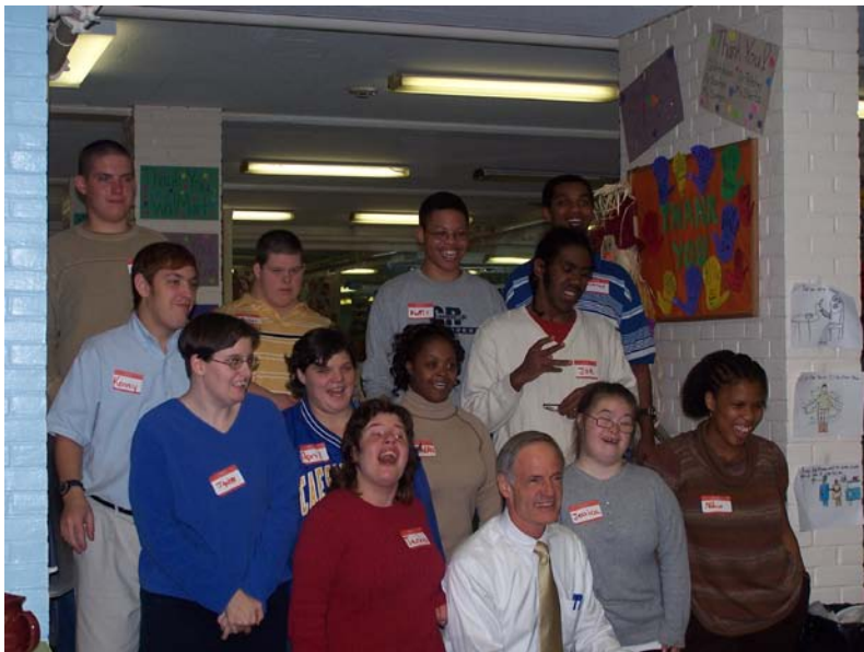
U. S. Senator Tom Carper visiting with students from the John S. Charlton School at the Transition Project Class at Wesley College