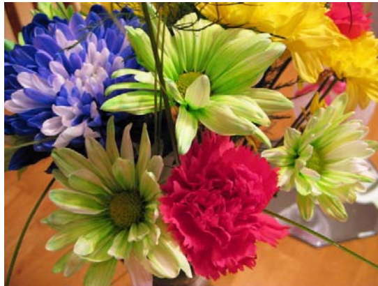
Thank you GACEC members