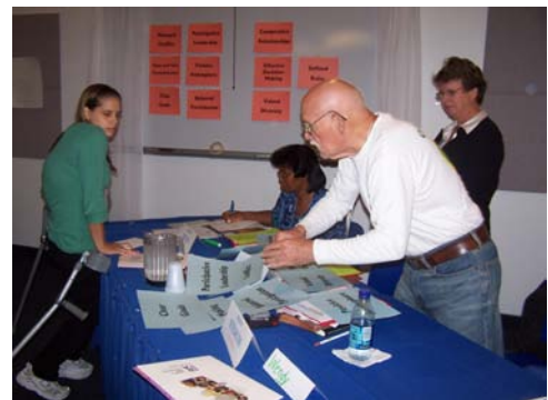
Members of Policy and Law, Adult Transition Services and Infant/Early Childhood Collaborate on a Project